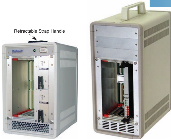
Series 815 with 5 slot backplane Dual 200W Hot-Swap Power Supplies

Integrated internal subrack assembly removes completely from outer enclosure and secured with thumbscrews - no tools required. Will support VME, VME64x, cPCI 6U backplanes up to 12 slots. Many power supply options. Can be configured with peripheral bays all accessible from upper front panels. Internal drive brackets available.