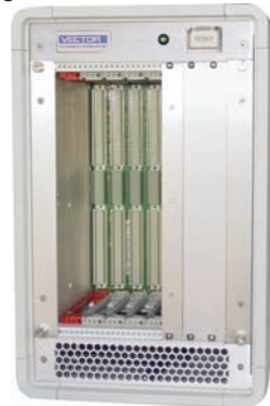
Series 815 with ATX Power Supply