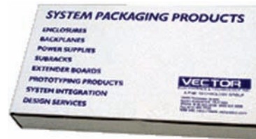
CCK Card Cage Kit

DIN 41612 connector compatibility with installation of AS1/2 adapter plates.