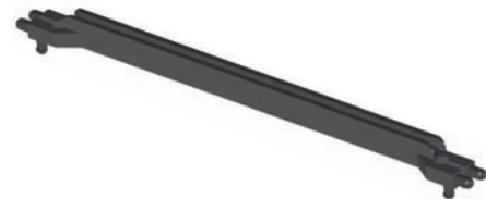
P/N CG1-160 160mm card guide