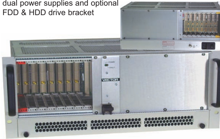
Backplane Standard Series 2345 shown with single power supply. Versions with ATX or DC power supply available. cPCI, PXI or VMEJ1 (See Pages 18, 19, 21)

Series 2345 is a system enclosure for 3U cards. The standard product comes with an 8-slot, 3U high performance backplane and a single 200 watt cPCI power supply and removable fan tray. The enclosure can be easily tailored to include peripherals, CD-ROM, FDD and HD, front (100mm) and rear (80mm) cards. There are several power supply choices listed below, including low cost ATX versions.