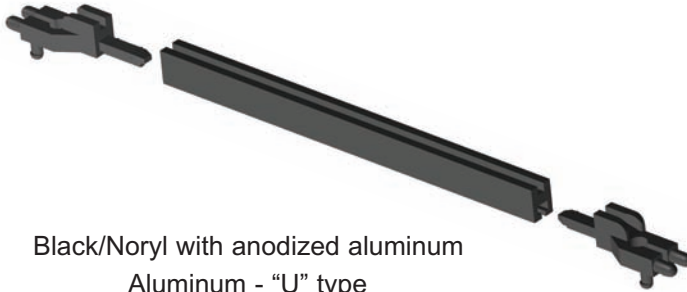
Black/Noryl with anodized aluminum Aluminum - "U" type