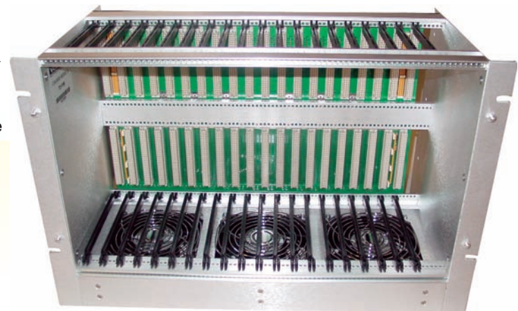
VectorPak™ powered subrack with VME J1/J2 backplane and integrated fans